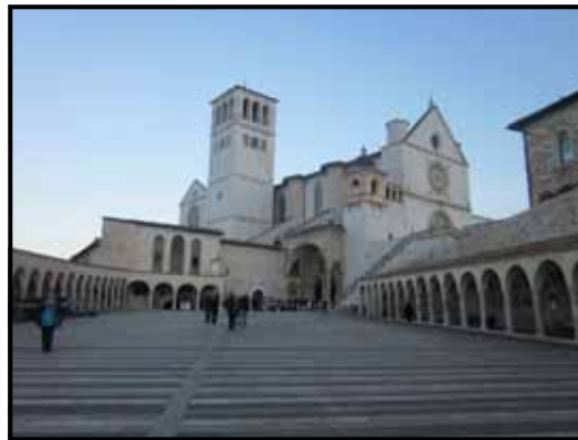
The Basilica of St. Francis rises on site of public executions in Assisi, their Mt. Calvary

In one part of the Basilica, we find the relics of St. Francis, his original tunic (habit), sandals, cords, the Rule that he himself made for the brothers who would follow his footsteps. It is a quiet, meditative and powerful atmosphere. This is also the room where the Franciscan brothers would gather daily to discuss all the matters of Franciscan life. The Franciscans have always been aware of the presence of St. Francis. Whenever they discussed something of importance it was always in this room. Going to the origins, to the beginnings, to the founding principles, to the founding father Francis was